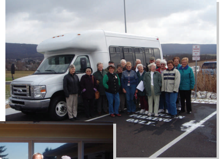
New LTC Van— Members of the Auxiliary and Foundation Board are present as the new van arrives!