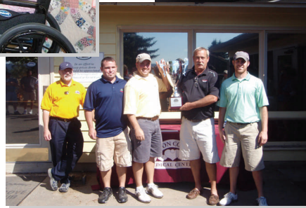
Team Earley— Takes the trophy in the 2010 Golf Tournament